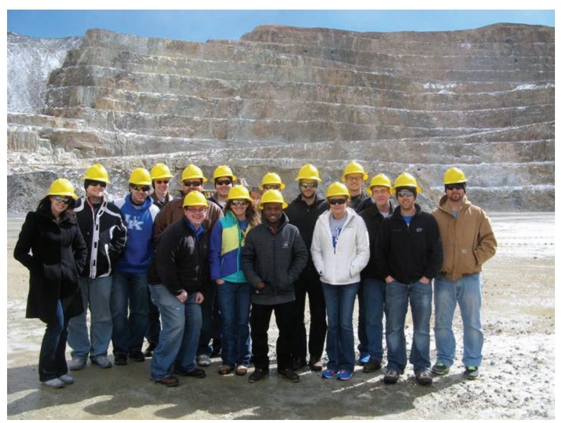
Students visiting the Cripple Creek Gold Mine.